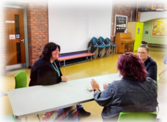
Taken during last week's coffee afternoons #happytimes

Parenting. We all know that being a parent is both a wonderful gift and a tremendous challenge. Fegans is a charity which offers support with a wide range of family issues. There is a wide range of advice available from how to help your child manage nightmares to how to support them in staying safe online. Please have a look at the following link for more information: www.fegans.org.uk/familyhub/